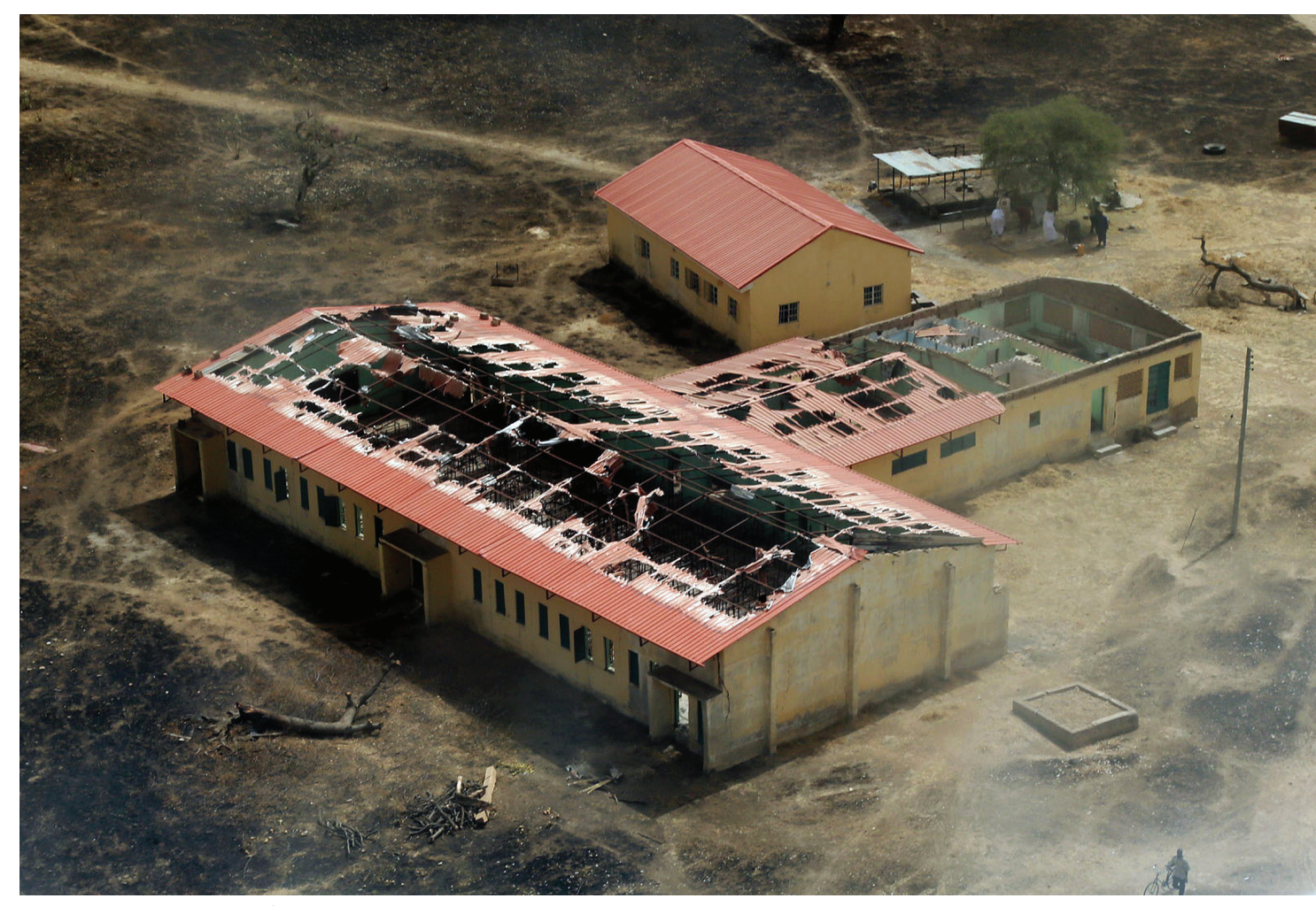
Aerial view of the Government Girls Secondary School Chibok taken on March 5, 2015.