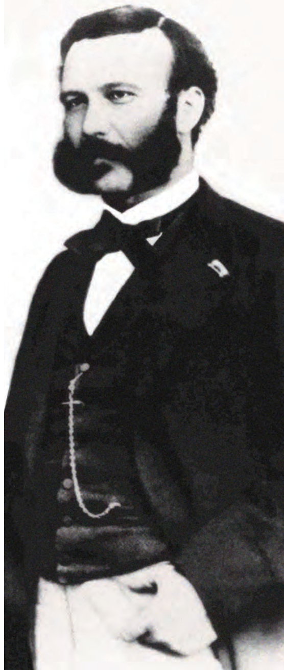
Henry Dunant, the founder of the Red Cross, whose work inspired humanitarian action and law

The materials should be taught as a clearly defined unit of studies, with students well aware that this is education that relates to values and behavioural development as well as factual knowledge. Because of the emphasis on active class discussion, there should be benefits also in terms of thinking skills, which will help with all school subjects.