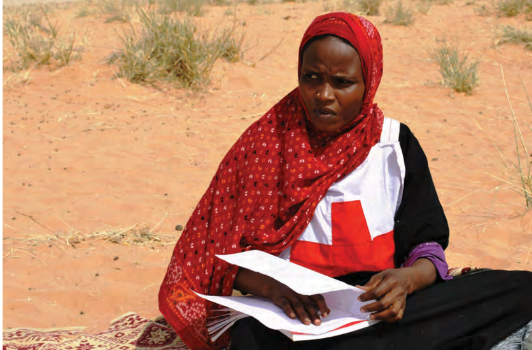
A Red Cross volunteer helps refer malnourished children for help in Burkina Faso

The Red Cross asks the people in the village if they will help build a house for Mariama. Some of the people in the village are from a different tribe.