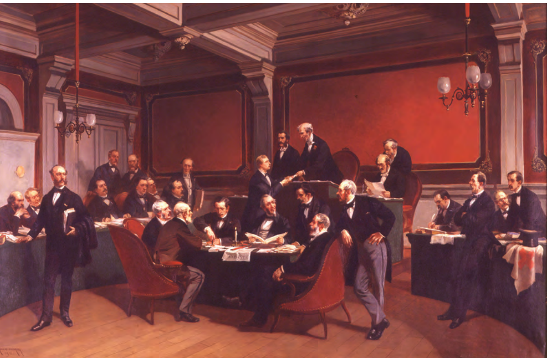
The signing of the first Geneva Convention at the Swiss capital's City Hall in 1864

They set up a society to discuss these ideas. They invited leaders from different countries to come to Geneva for a meeting. Henry asked them to set up national societies in their countries to help the wounded. They asked themselves, “How will the soldiers know they are medical workers?” They all agreed to use a red cross on a white cloth for their flag and for arm-bands.