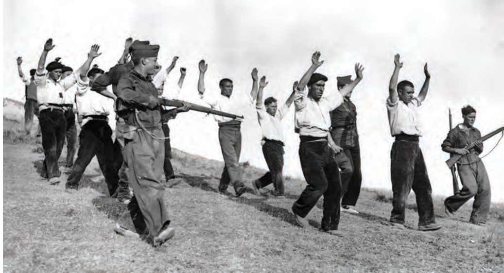
Soldiers escort republican fighters during the Spanish Civil War (1936-1939)