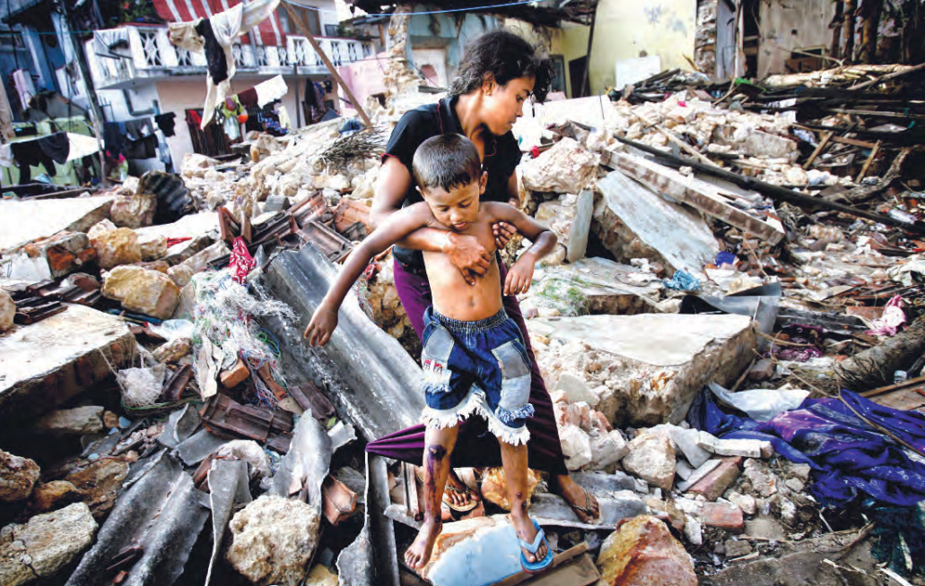
The Red Cross and Red Crescent Societies help victims of disasters such as tsunamis