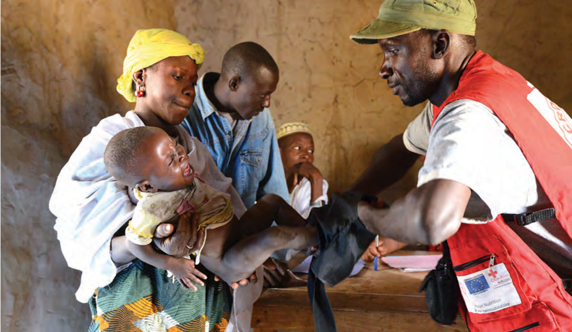
The Red Cross assesses a child's level of malnutrition in n Penguese, Burkina Faso

relief and assistance for the victims of war, to first aid training and restoring family links.