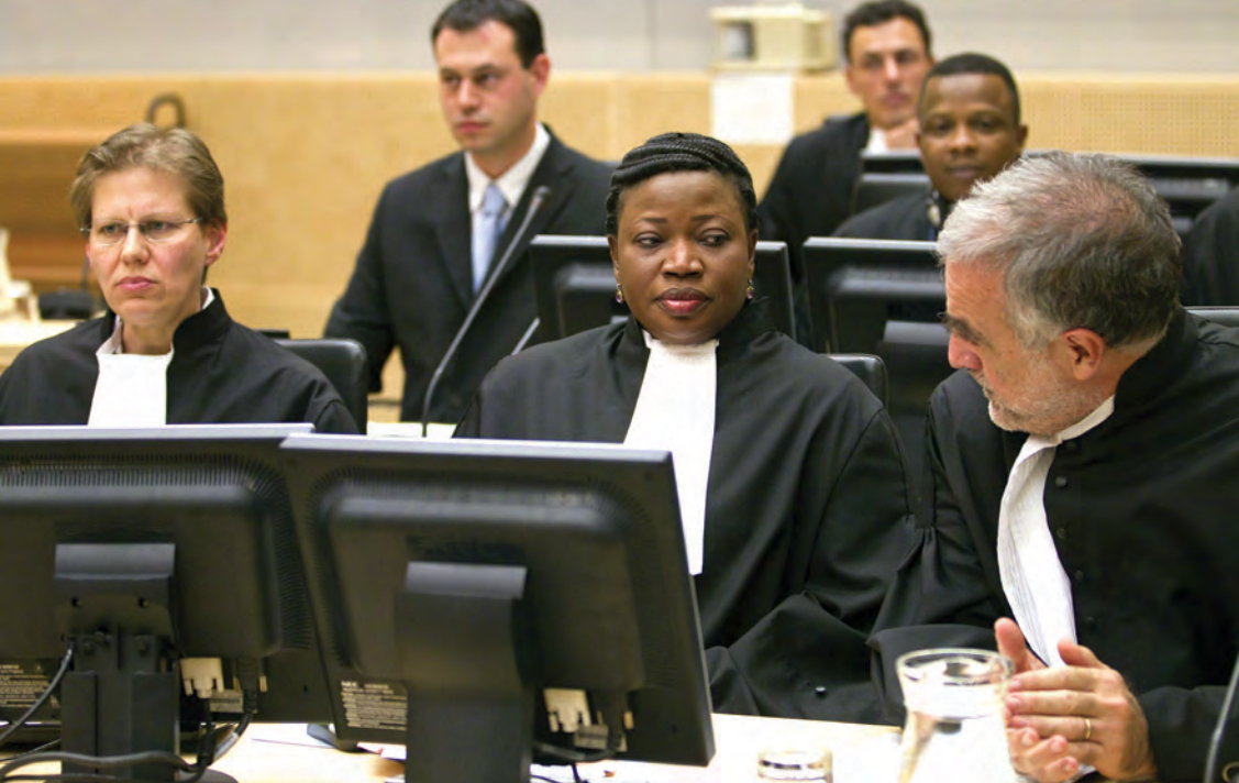
The prosecutors bench at the trial of Congo warlord Jean Pierre Bemba